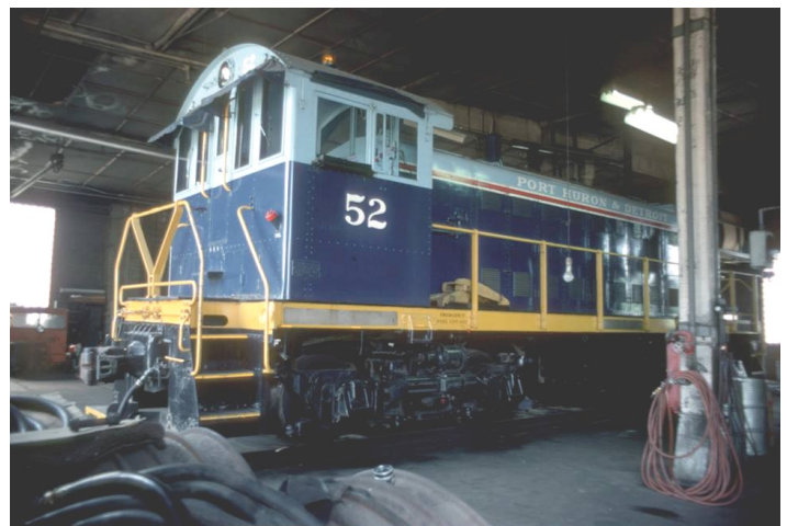
In the foreground, we can see a few tires stacked together. As always, the engine house is spotless. Venerable #52 awaits the call for duty. Way back in the corner lies a "speeder". This was one hell of a railroad, wasn't it?