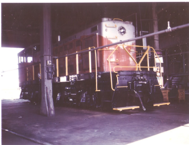
Here's a rare Poloroid taken in the early 1970's. That original red and gray livery is about to undergo a totally different metamorphosis!