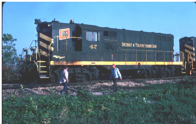
Sturdy Detroit & Toledo Shore Line Geep 7s