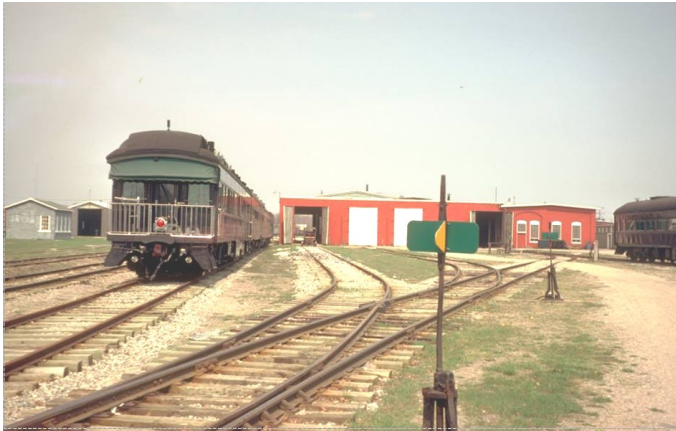
D&M roundhouse and Office Car #2, Tawas City. All gone.