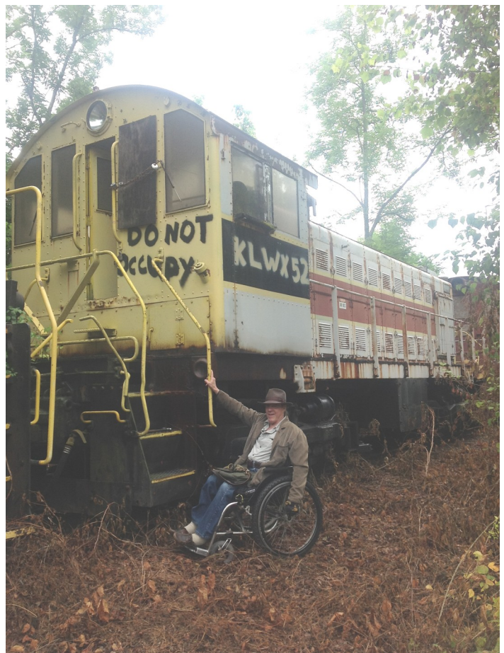
Back in the weeds, #52, now 67 years old, sits forlorn, awaiting a sympathetic owner. Fortunately, the arrangement with the G&O allows free (and safe) storage inside the gates of the Knoxville Locomotive Works for a two-year period. At this facility, the subsidiary has all it needs for an initial full cosmetic restoration back to the pre-1980s sale condition, after which it would be shipped north, back to its home base in Port Huron.