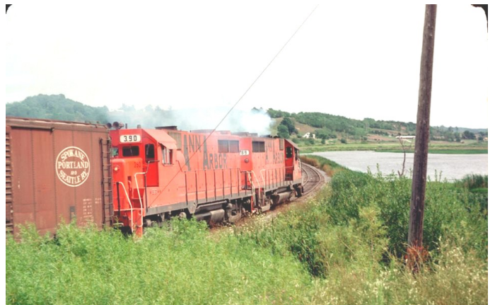
Two Ann Arbor Geep 35s rounding the curve, Frankfort.