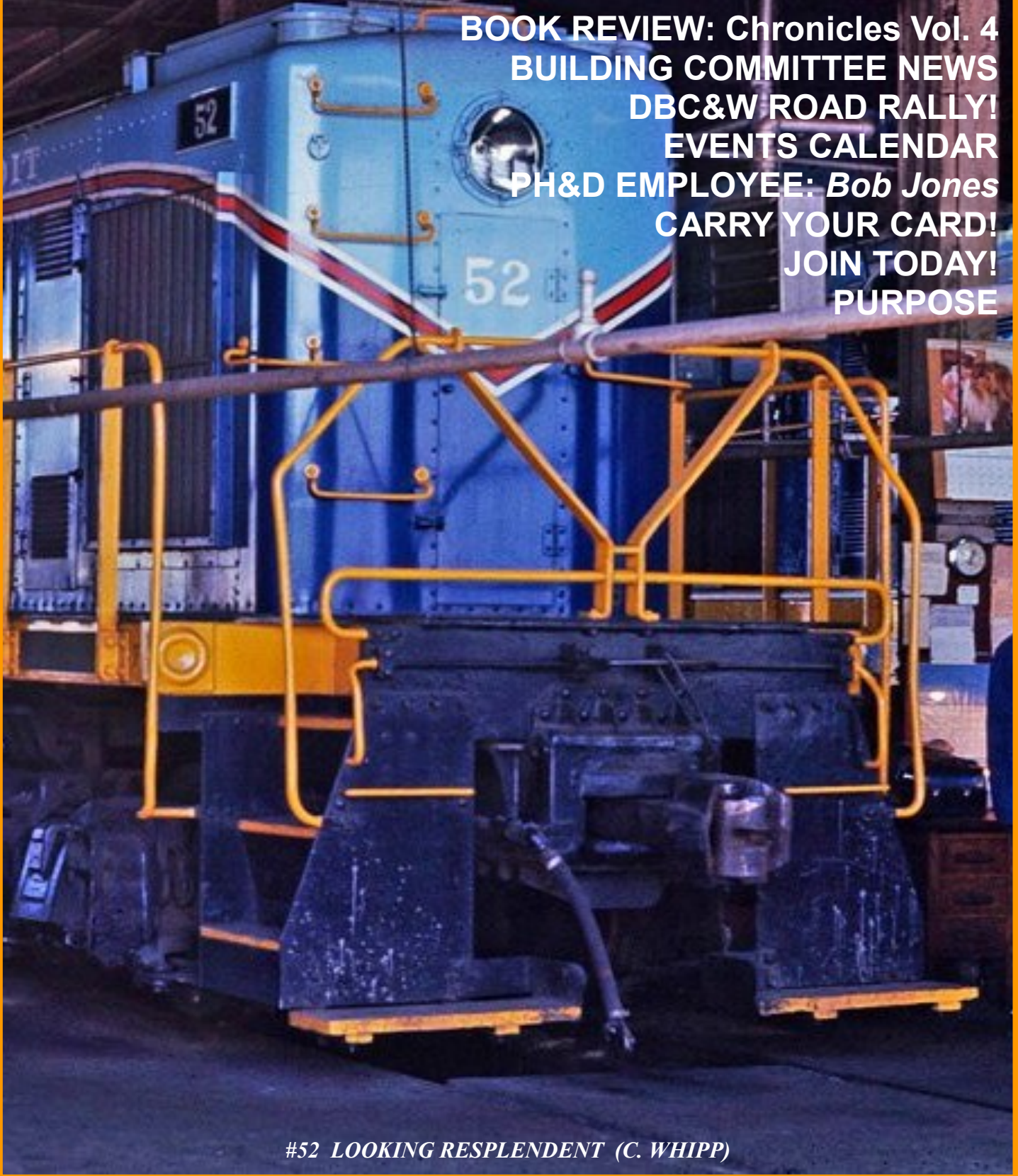
#52 LOOKING RESPLENDENT (C. WHIPP)

BOOK REVIEW: Chronicles Vol. 4 BUILDING COMMITTEE NEWS DBC&W ROAD RALLY! EVENTS CALENDAR PH&D EMPLOYEE: Bob Jones CARRY YOUR CARD! JOIN TODAY! PURPOSE