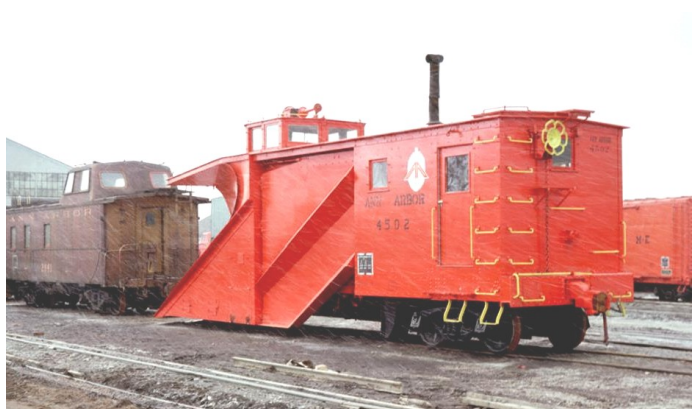
Ann Arbor's plow #4502 getting a rain wash up in Cadillac.