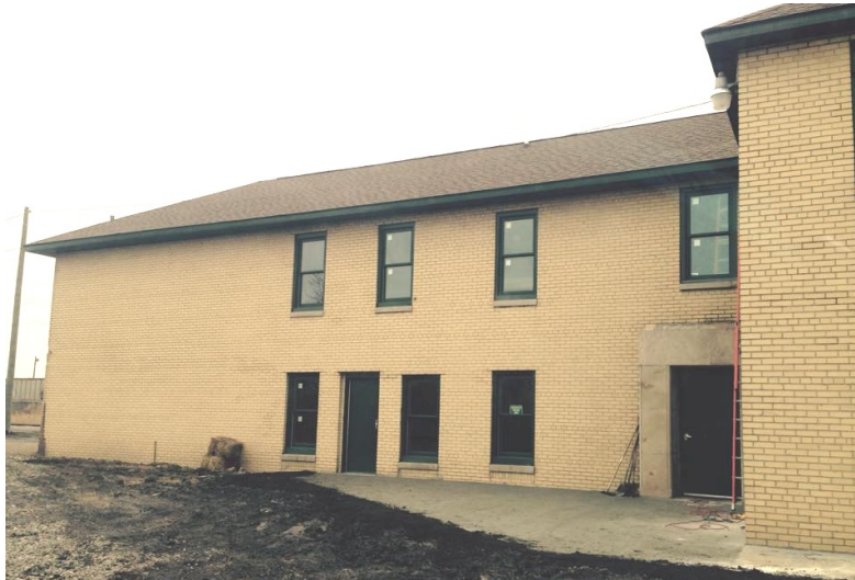
New PH&DRRHS patio! Coming to a weekend work session: Shrimp on the Barbie!

There is much more in store and we'll be alerting you via our website and Facebook pages. You can bet that most Saturday's will find some activity going on. Check our website for scheduled work sessions ( phdrailroad.com ) Bring a camera, as we front the Class I CN yard, perfect to watch the action!