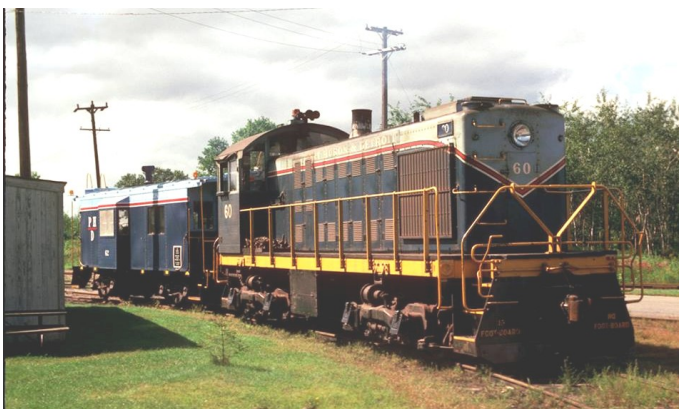
S2 PH&D #60 ready for the 1:00 job.